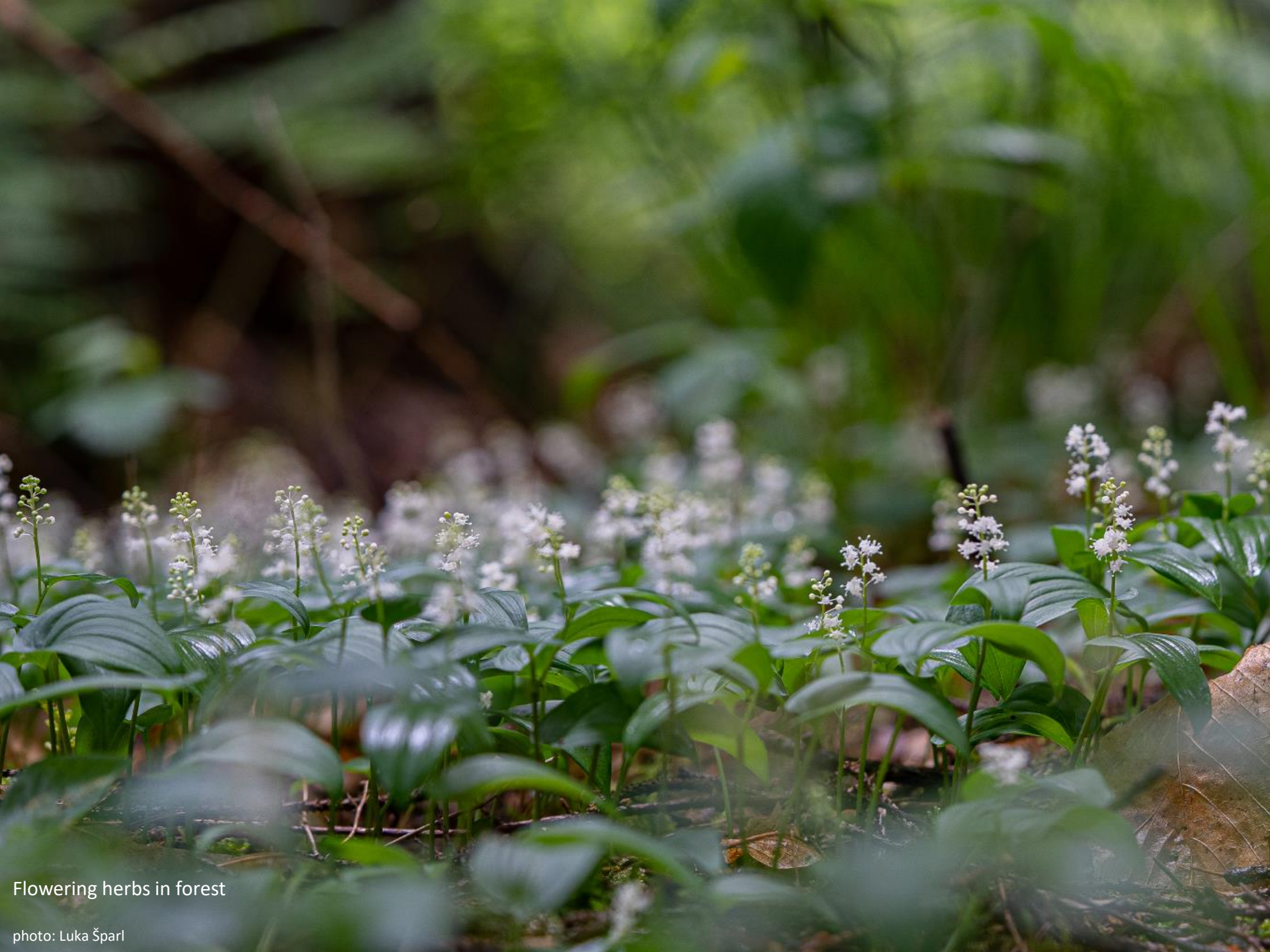
Flowering herbs in forest