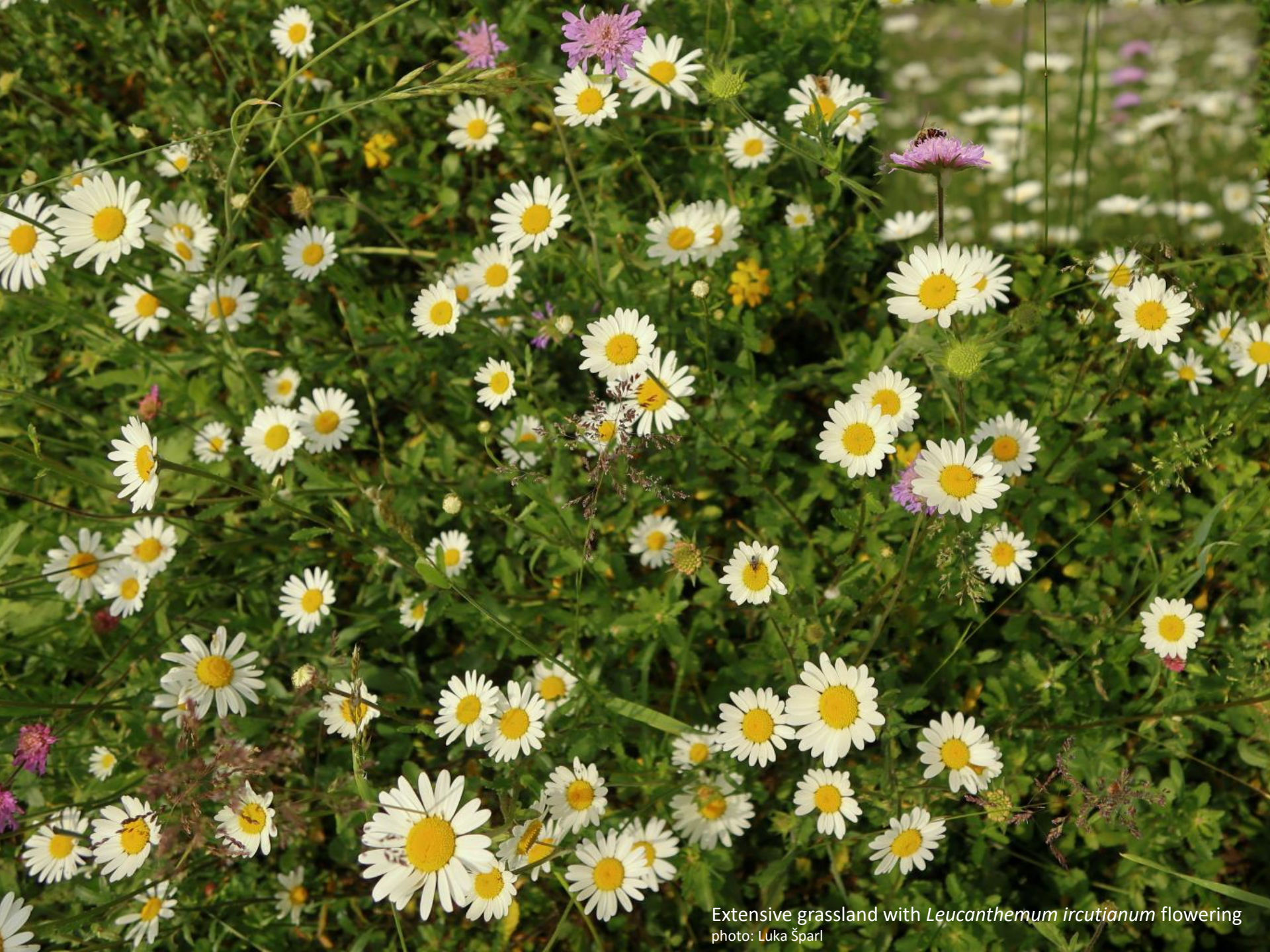
Extensive grassland with Leucanthemum ircutianum flowering