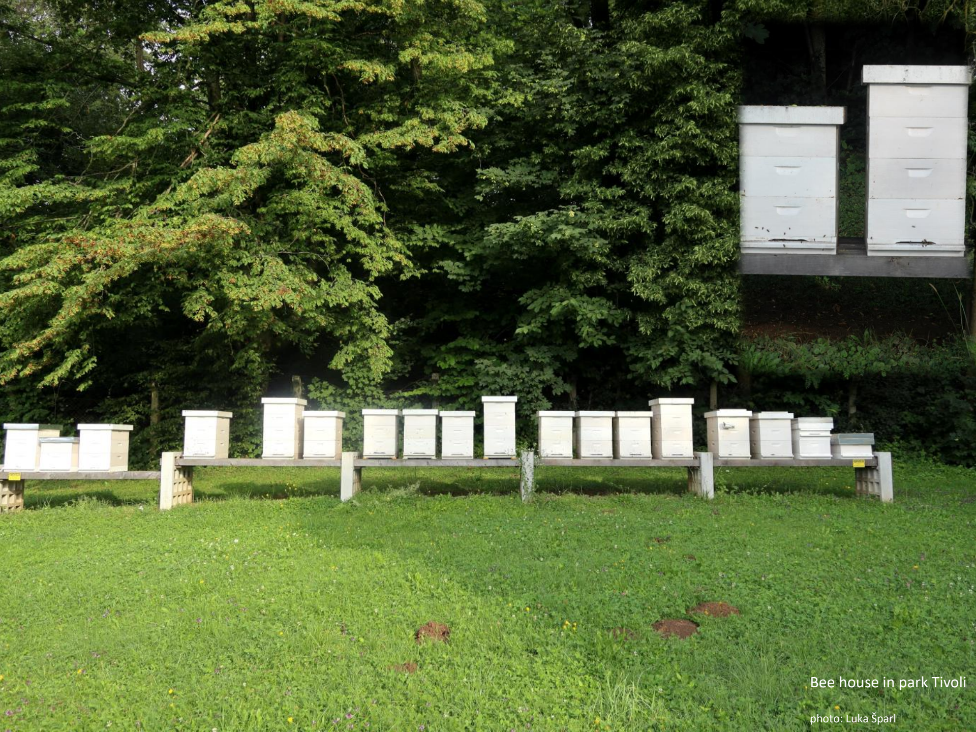
Bee house in park Tivoli