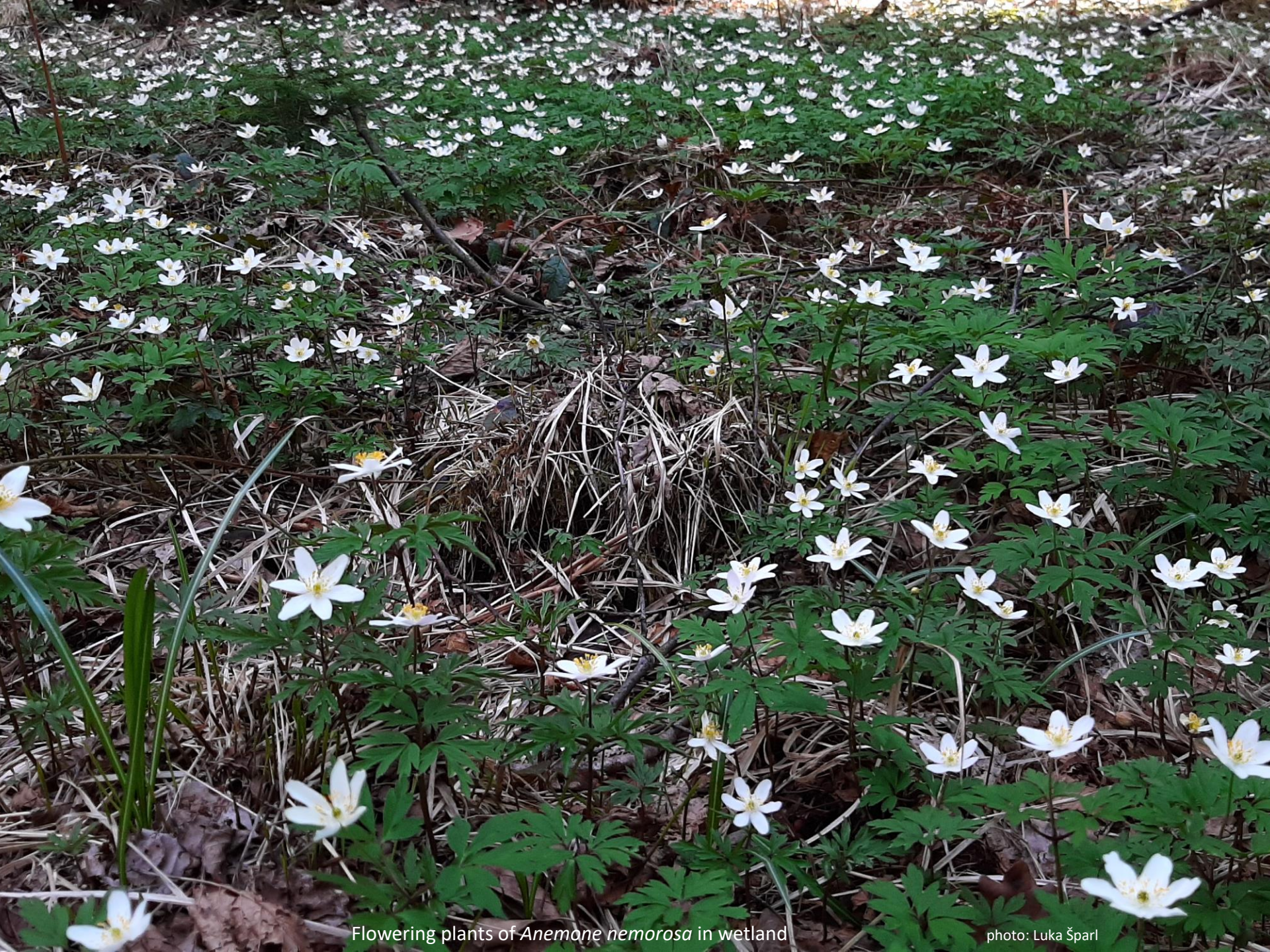
Flowering plants of Anemone nemorosa in wetland