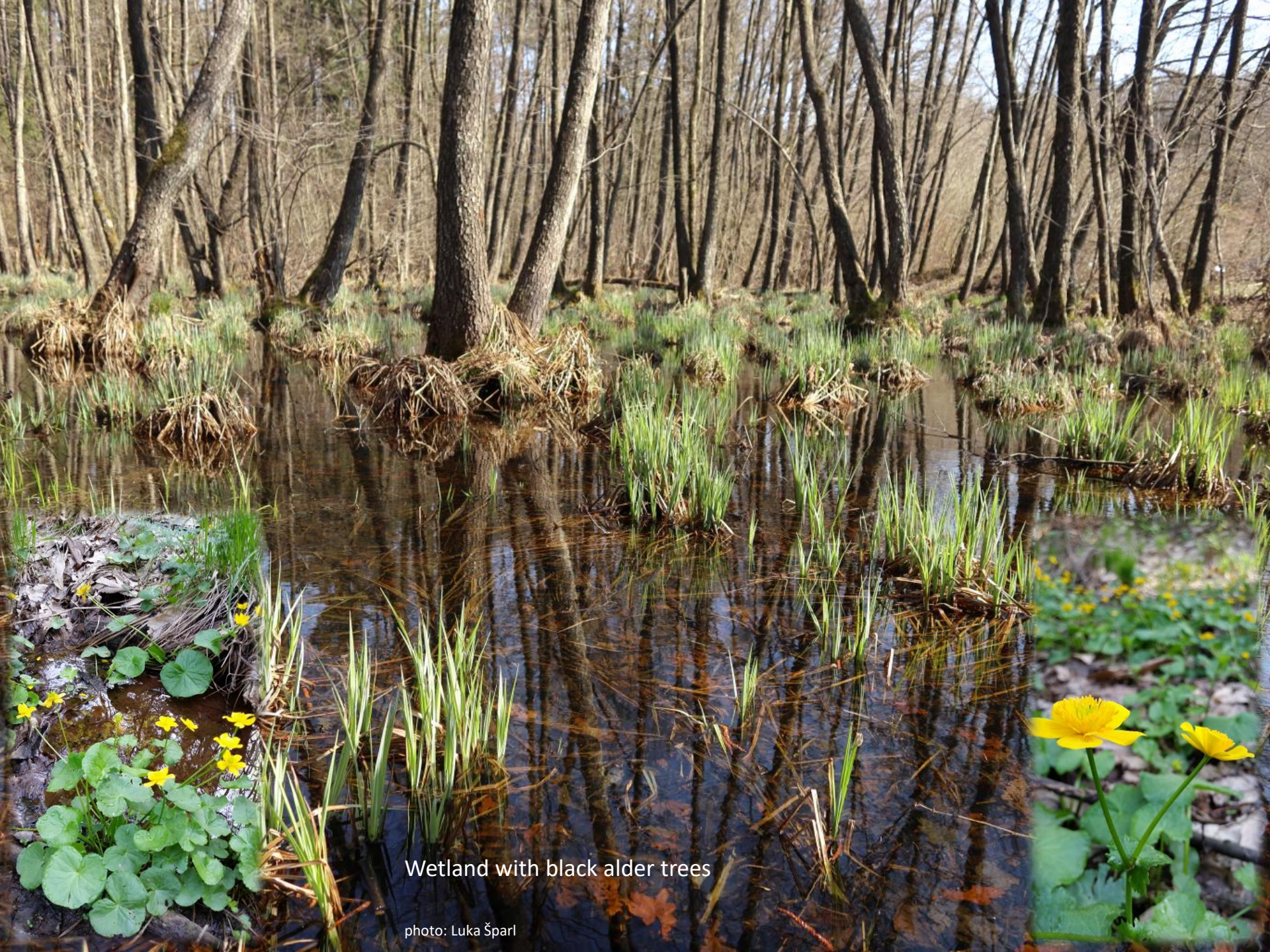
Wetland with black alder trees