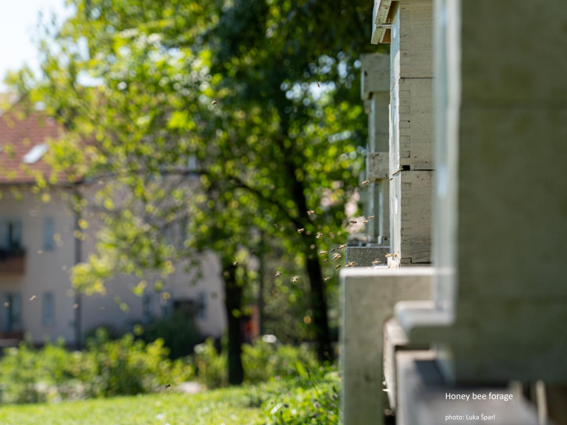
Honey bee forage