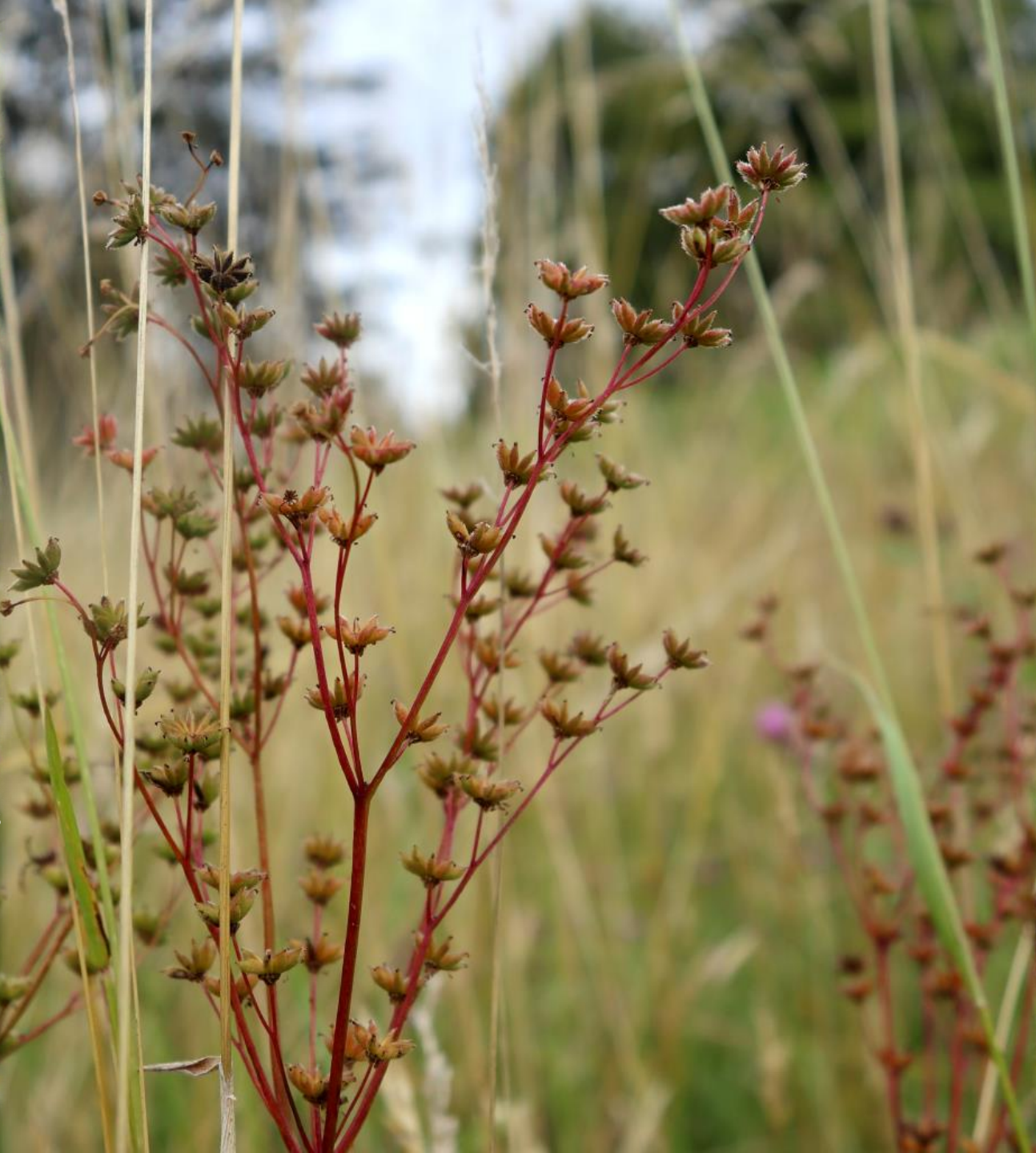
Plants from grasslands