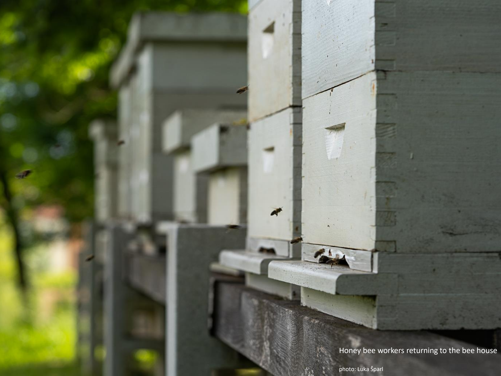
Honey bee workers returning to the bee house